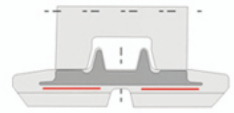
B2 Support Type

COMPETITIVE PRICE XTREME STRENGTH TECHNICAL EXCELLENCE CXT RUBBER TRACKS